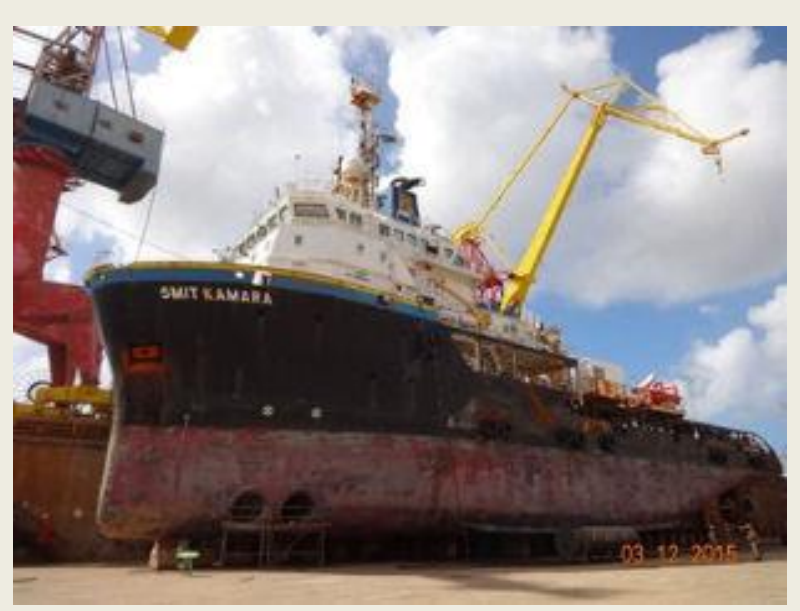
VIKING SUPPLY SHIPS AWARDED FOR ITS FOCUS ON ARCTIC TECHNOLOGY

The vessel arrived from Brazil and will be after her dry docking operate in Venezuela - Golf de Venezuela South of the Caribbean Island Aruba. The Smit Kamara is in the dry dock for thruster repairs. The vessel is owned by Smit Shipping Singapore Pte. Singapore and managed by Smit Singapore Pte. Ltd. - Singapore. She has a grt of 2,666 tons a dwt of 1,700 tons and is classed American Bureau of Shipping.