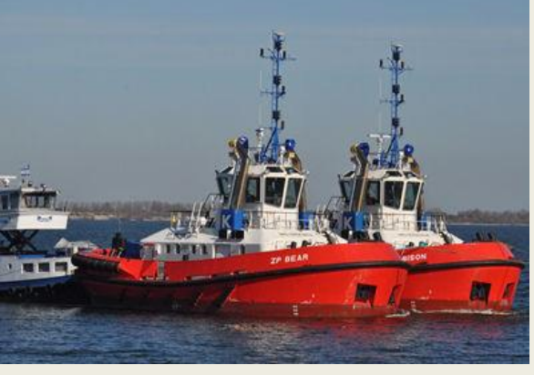
tug named ZP Bison and ZP Bear for owner Kotug and the two Damen ASD2411 named Brake under the Unterweser Reederei GmbH – Hamburg; Germany flag and the Perfect under the Lütgens and Reimers – Hamburg; Germany flag. After unloading the vessel were transported to the Damen Maaskant Shipyard – Stellendam; Netherlands for the final deliveries.

DAMEN SHOALBUSTER 2509 BOMMEL KIEL-CANAL